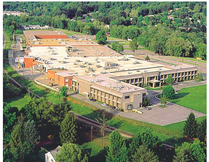
MANUFACTURING PLANT | BRISTOL, VA