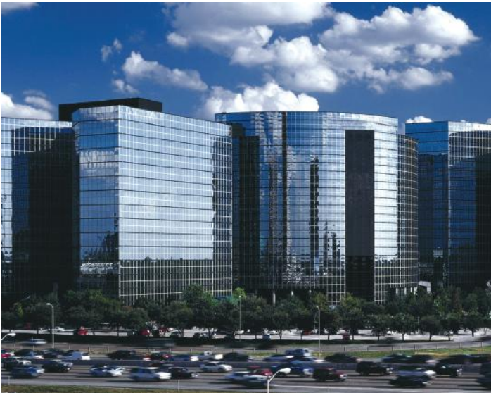
CORPORATE HEADQUARTERS | DALLAS, TX

1.800.864.6585 | www.AirScrubberPlus.com